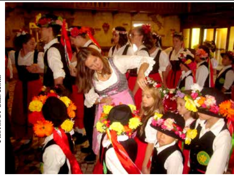
Colourfully-attired members of all ages in the Teutonia Youth Group prepare to enter the main hall to perform at the annual Kirchweih event.