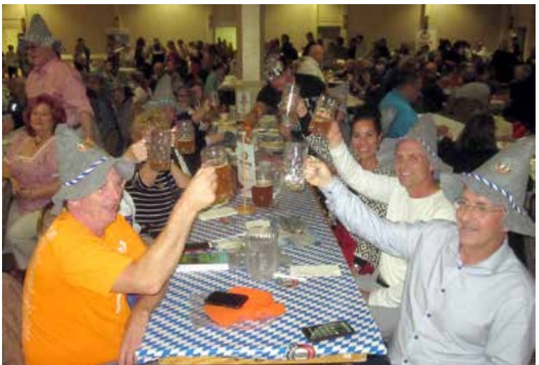
Windsor's first Oktoberfest was set up by the Teutonia Club in October, 1971 -- and it remains wildly popular, with 700 people attending on Saturday, September 28, 2019! This huge crowd in the Fogolar's Main Hall includes MP Brian Masse (lower right). More on p. 4.