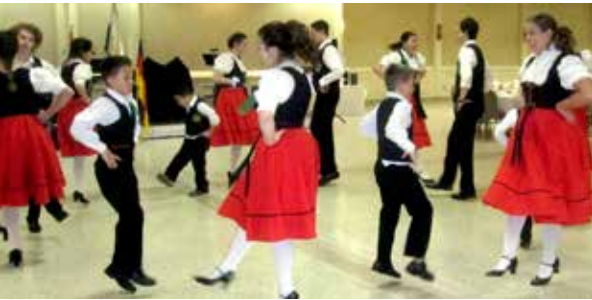
Left and right: The Teutonia Club's Senior Youth Group members have been -- and will continue to be -- busy teaching the considerably younger members of the Youth Group the various dances that have been performed over the years. All of the dancers, particularly the youngest ones, perhaps due to their unpredictability, are very popular with audiences.