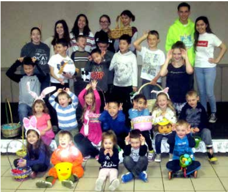
The Senior Youth Group members have been the main organizers of the annual Teutonia Easter Egg Hunt. They not only coloured 13 dozen eggs for the occasion, but also ran the competitive games in which the smaller children participated after the hunt (and which kept parents and grandparents busy shooting photos of their young ones having fun.) The back row in the photo above shows many (but not all) of the Senior Youth Group organizers. Each child went away with Easter eggs, as well as a chocolate gift.