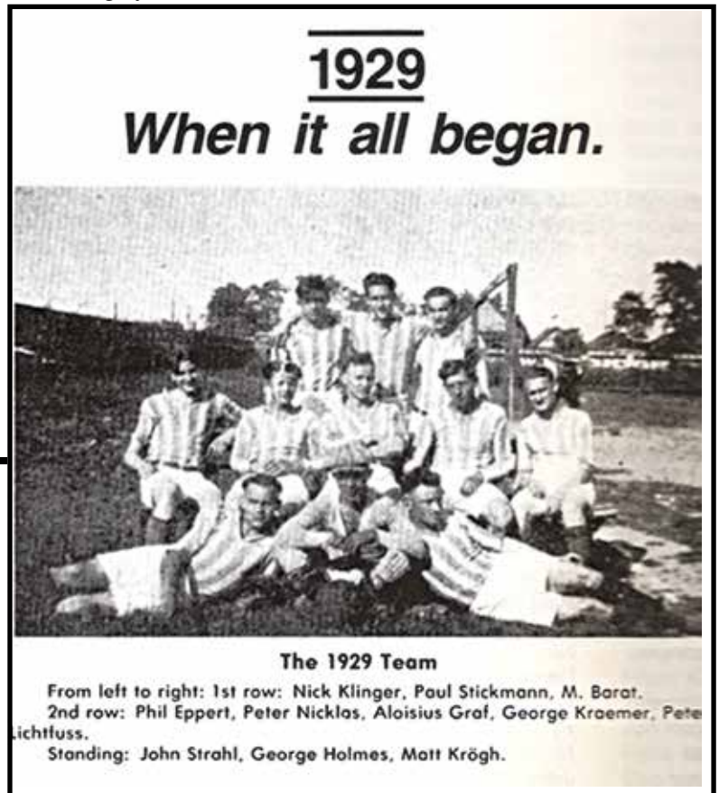
The 1929 Team

ALL of the above Teutonia Club sub-groups invite MEMBERS to join them at the Fogolar Furlan Club in these weekly activities. Take advantage of these opportunities to meet new people, to make new friends, and to HAVE FUN!