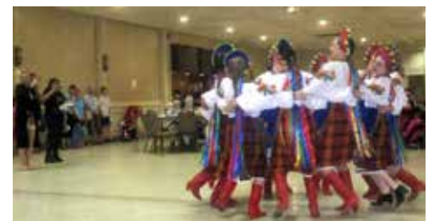
Above, the Ukrainian Dance Group, and below, the Teutonia Youth Group; heritage dancing! More on p. 4.